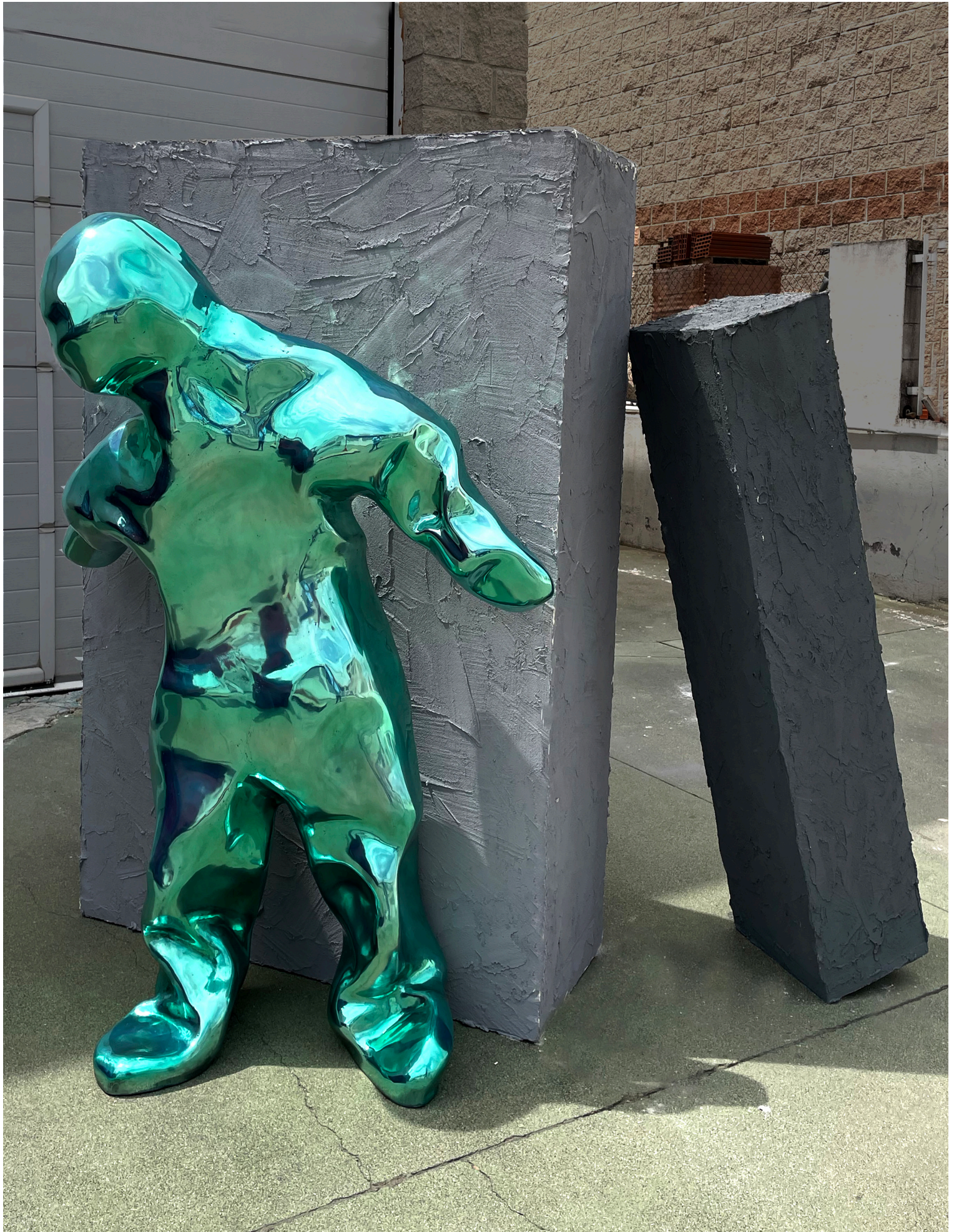
Francesca Martí Humilis as Atlantes (2023), polished aluminium, automotive lacquer, wood covered in micro-cement / aluminio pulido, pintura de automóvil, madera recubierta con micro-cemento, 170 x 100 x 70 cm