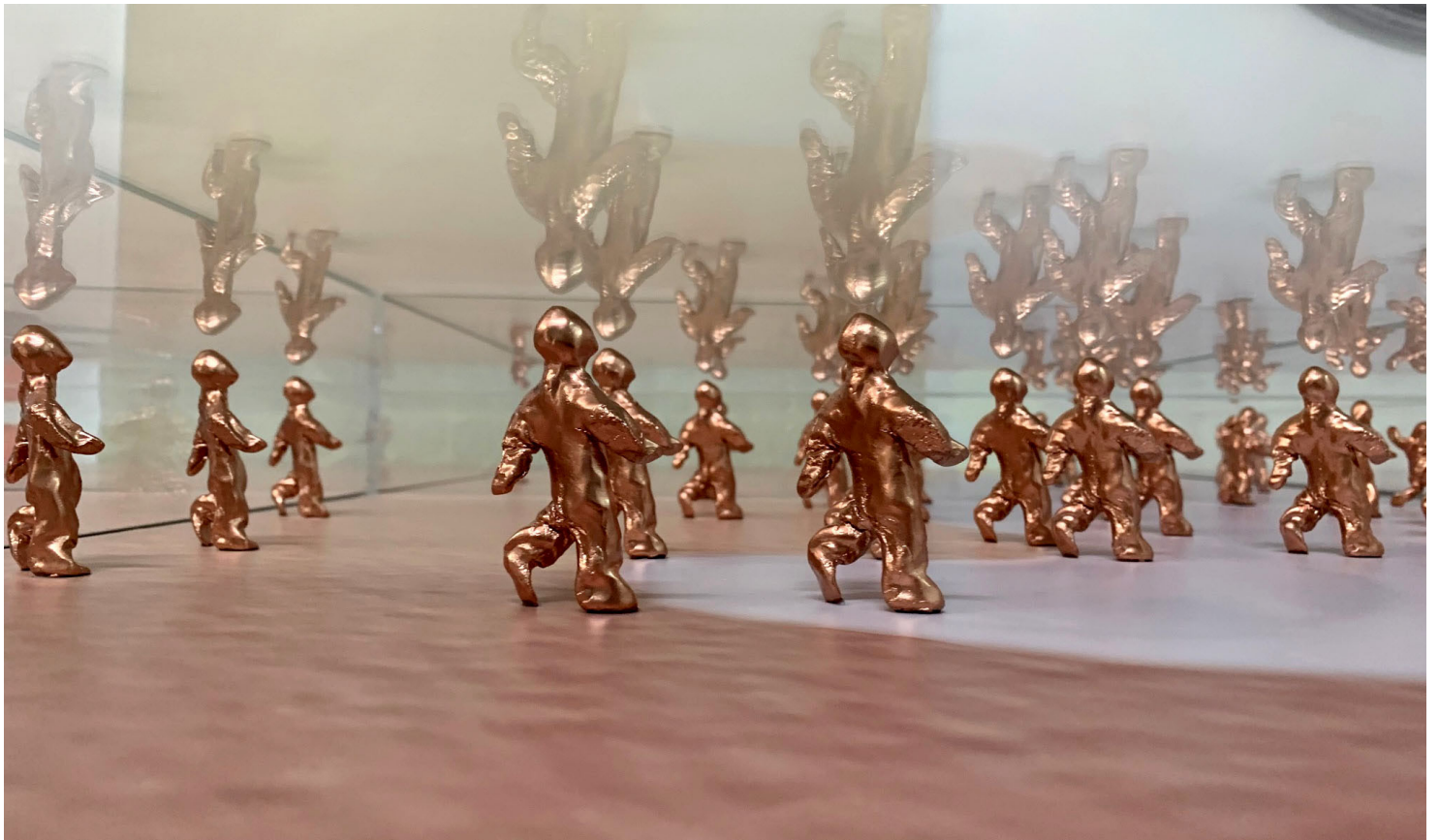
Francesca Martí (detail of installation) From the Ashes (2020), photographs, small Believers sculptures in 8 perspex boxes / fotografías, esculturas pequeñas de Believers en 8 cajas de metacrilato, 150 x 300 x 10 cm